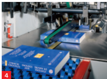
4 Product-friendly delivery with driven upper and lower belts