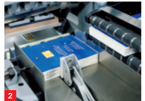
2 Insert with brush, spine first