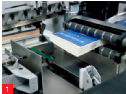
1 Loading conveyor with thickness control device