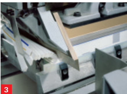
3 Perfect three-sided trimming in a single station