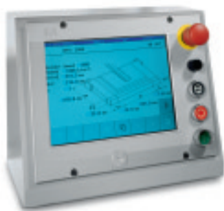
Automatic make ready system and touchscreen control

The swing cut principle guarantees the best possible trim quality and a neat appearance. Consequently, it guarantees the high quality of the end product.